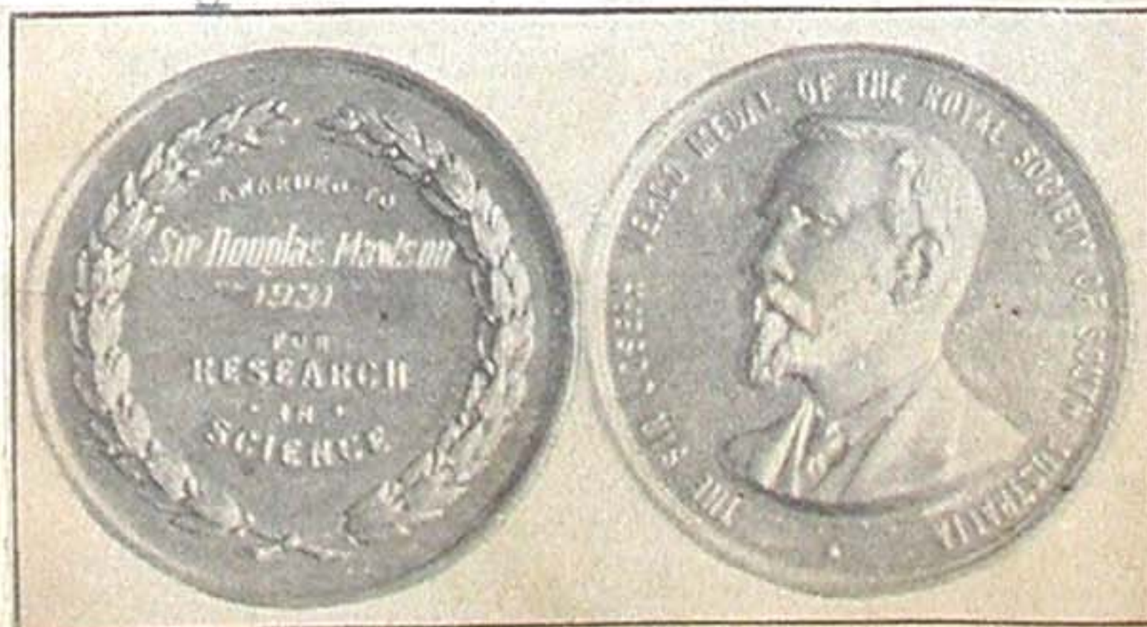
BOTH SIDES of the Sir Joseph Verco Medal, which will be presented tonight on behalf of the Royal Society of South Australia, to Sir Douglas Mawson for his exploration work. It has only been awarded on two previous occasions.