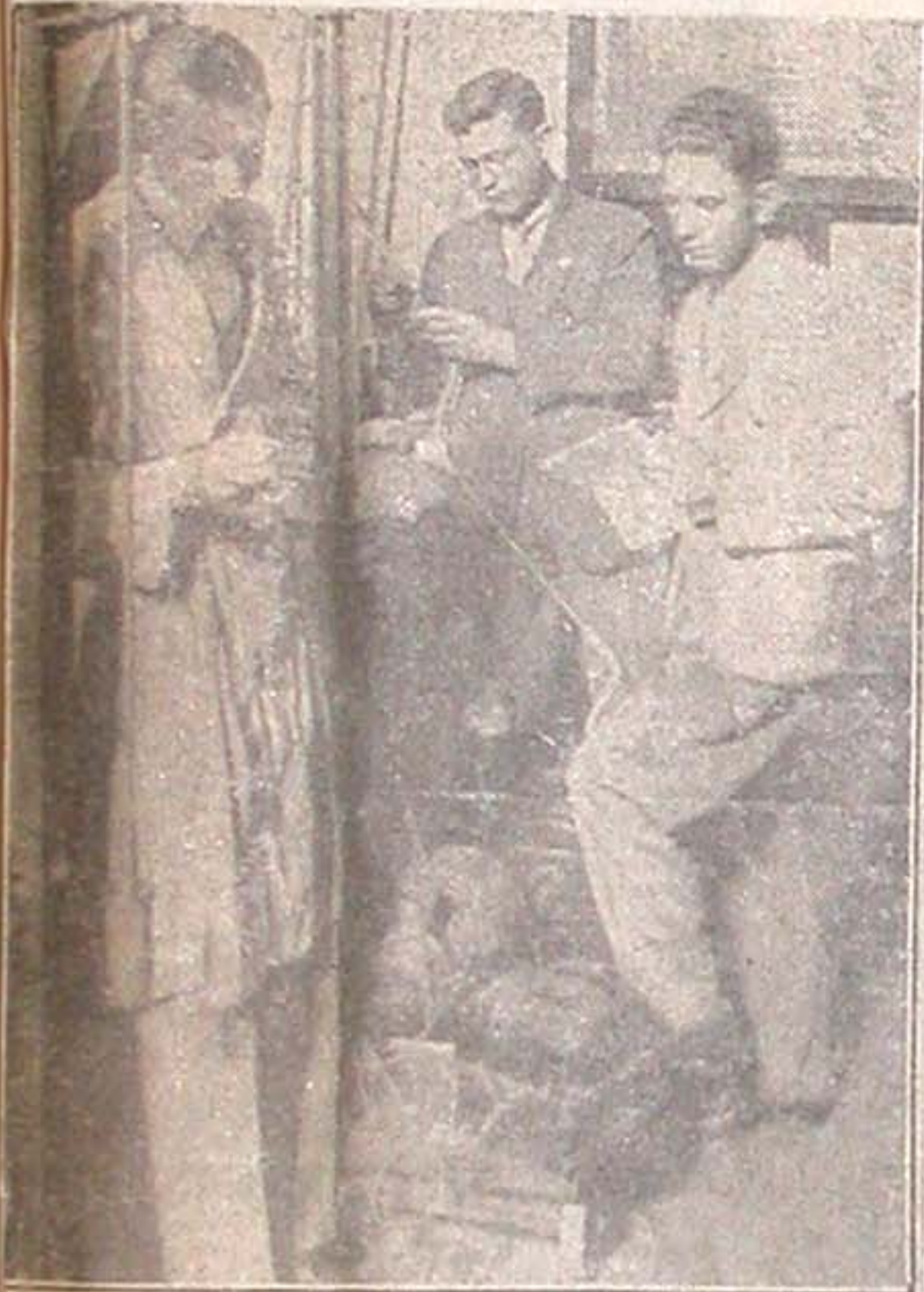
WEEKLY PHYSICS LECTURE at University: Kater's Reversible Pendulum as used in gravity surveys and the Guinea and Feather experiment to show that a heavy body and a feather fall at the same rate in a vacuum.