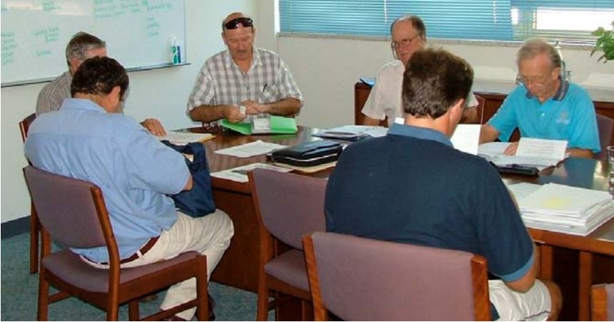
Members of your Committee, hard at work in the Alumni Boardroom.

Please consider nominations for the 2004/2005 Committee. New members and new ideas are always welcome.