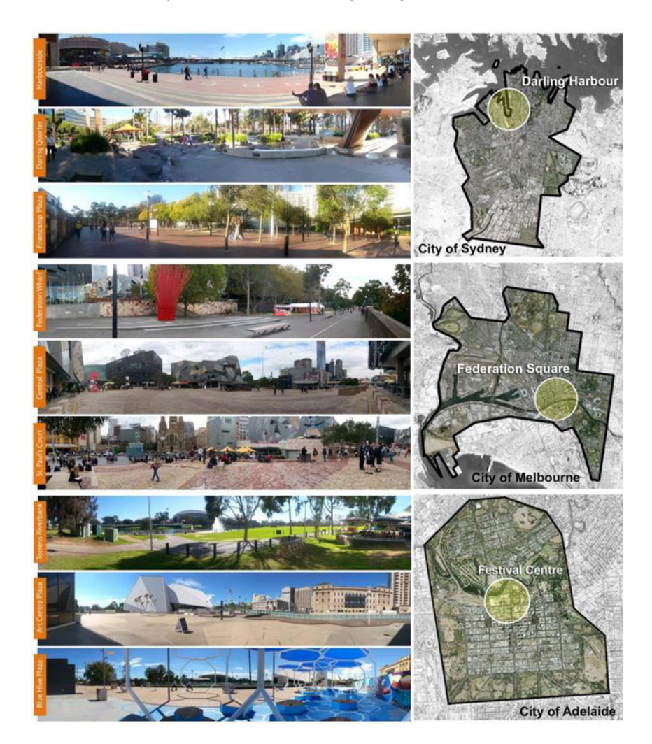
Fig. 1. Darling Harbour (Sydney), Federation Square (Melbourne) and Festival Centre (Adelaide) are three multi-functional public spaces with diverse space configurations, and supportive land uses.