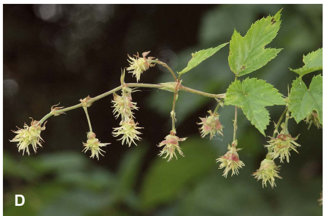
Pl. 3. A , inflorescences from male plant 'A' and female plant 'B'; infructescences 'C', and details of flowers and seed. B , young vines regenerating from rhizomes after slashing, C.J.Brodie 6833, Woodhouse, Adelaide Hills, SL. C , infructescence, in cultivated crop, Hallertau, Germany. D , female inflorescence. Illustration: A, Otto Wilhelm Thomé, Flora von Deutschland, Österreich und der Schweiz 1885, Gera, Germany.