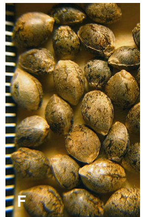
Pl. 1. A , inflorescence and flower from male plant 'A', and female plant 'B' with flower and fruit below. B , male inflorescence. C , hemp stalk with sheathing bast fibres pulled apart. D , hemp plant in fibre crop, France. E , female inflorescence showing whitish glandular hairs. F , seeds (graduations 1 mm). Illustration: A, Otto Wilhelm Thomé, Flora von Deutschland, Österreich und der Schweiz 1885, Gera, Germany. Photos: B & F, Erik Fenderson; C, Natrij; D, C.J. Brodie; E, from: Bokské, CC BY-SA 3.0.