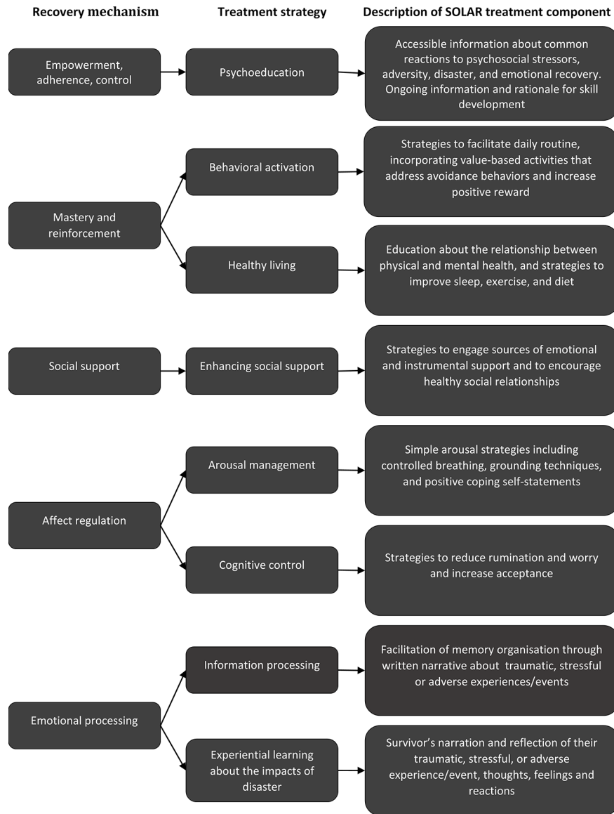
FIGURE 1 | The SOLAR program: Mechanisms of post-trauma and mental health recovery, relevant treatment strategies, and summary description of SOLAR treatment components.

psychiatric diagnoses, to enable a strategic, scalable, stepped model of post-trauma mental healthcare. The program comprises six modules, outlined in Table 1 .