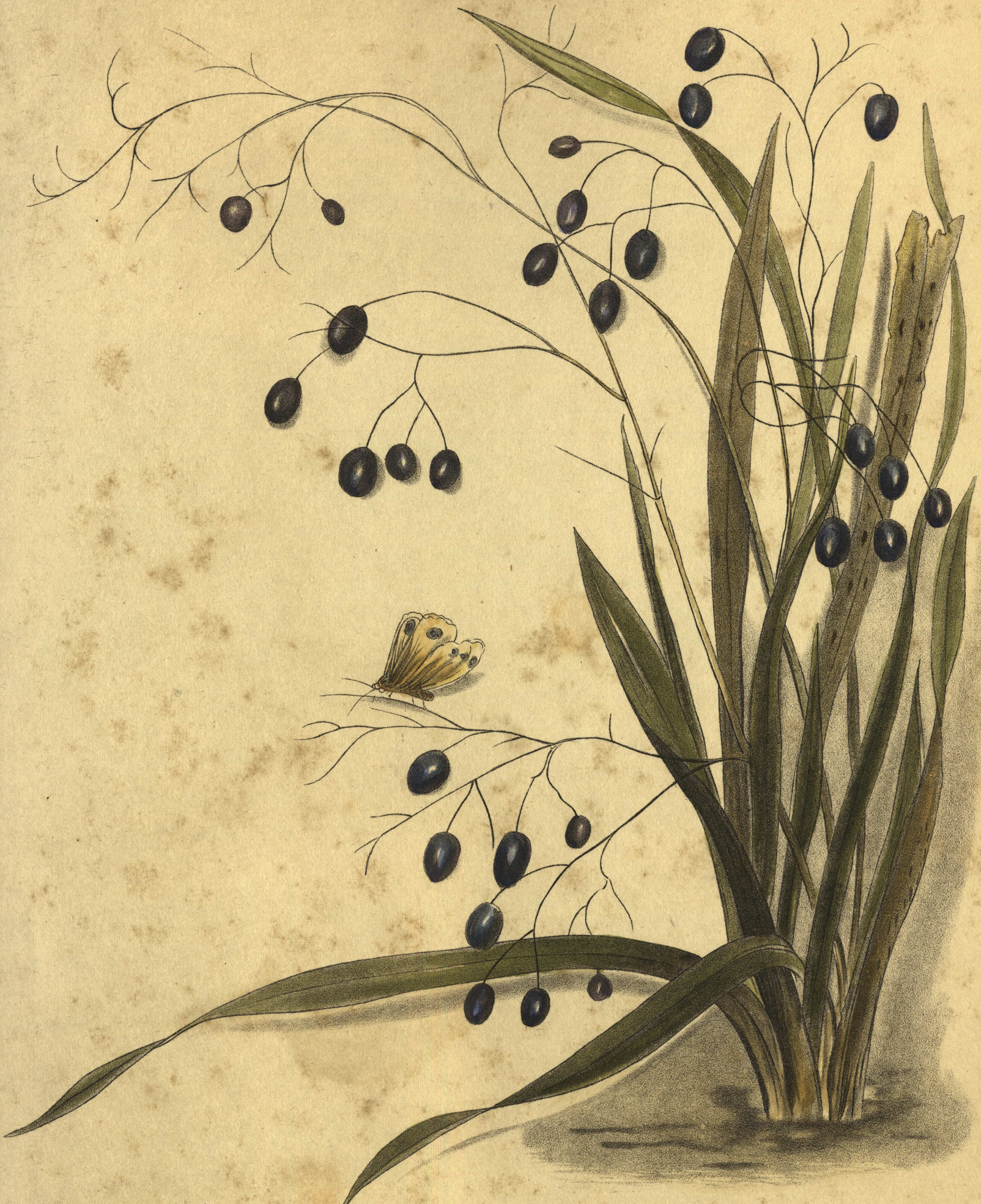
Dianella intermedia. (Blue berry).

A grass like plant. Leaves 1-5 feet long; very slender, much branched stems, flowers small greenish white, berries a lovely blue. More common and finer in the North than Middle Islands, frequent in fern lands and woods.