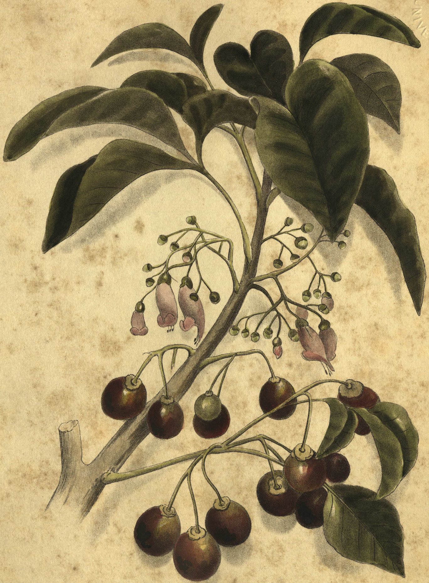
Vitex littoralis. (Puriri)

A handsome forest tree 50-60 feet high, common along the east coast of the North Island. Flowers pink, berries bright red, ripe berries and flowers appear on the same branch at the same time. Wood extremely hard.