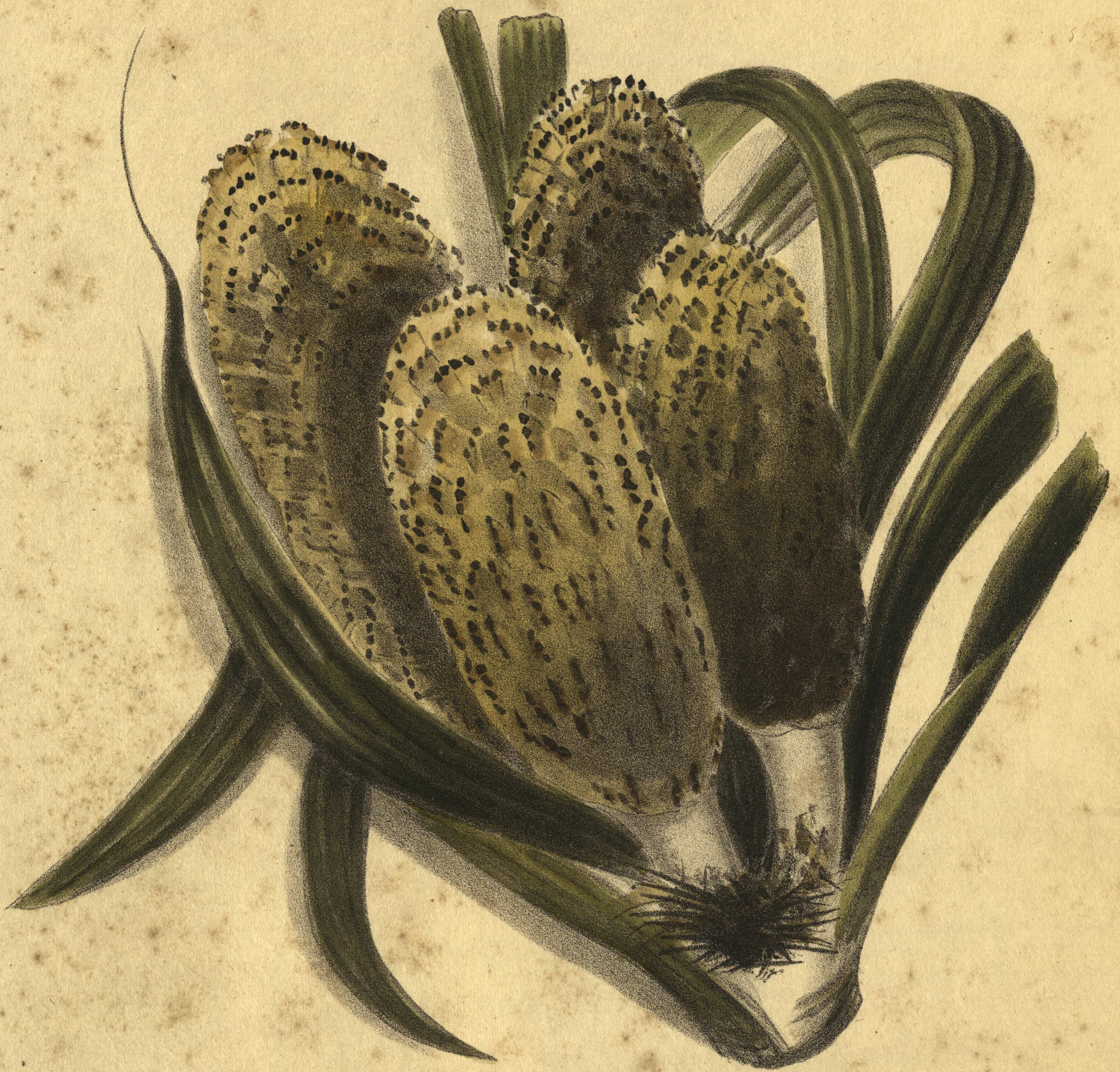
Freycinetia Banksii. UREURE.

Ureure fruit of the Kiēkie a lofty climber giving the forest of the North Island a tropical appearance. Leaves two feet long, sometimes used for basket making. Fruit and flower both edible.