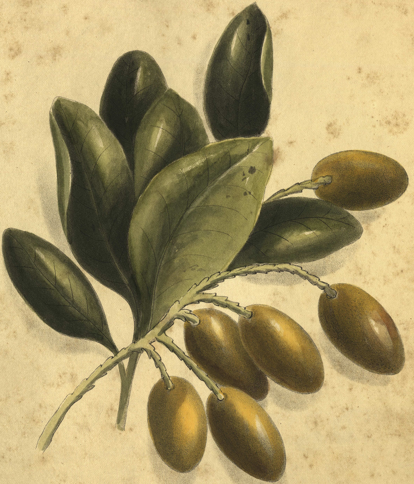
Corynocarpus laevigata. (Karakā)

A laurel-like tree 40 feet high, with leaves 4-7 inches long. Fruit bright orange colour, pulp edible, the kernel poisonous until steeped for a long time in salt and water, formerly much used for food by the Maories, North Island.