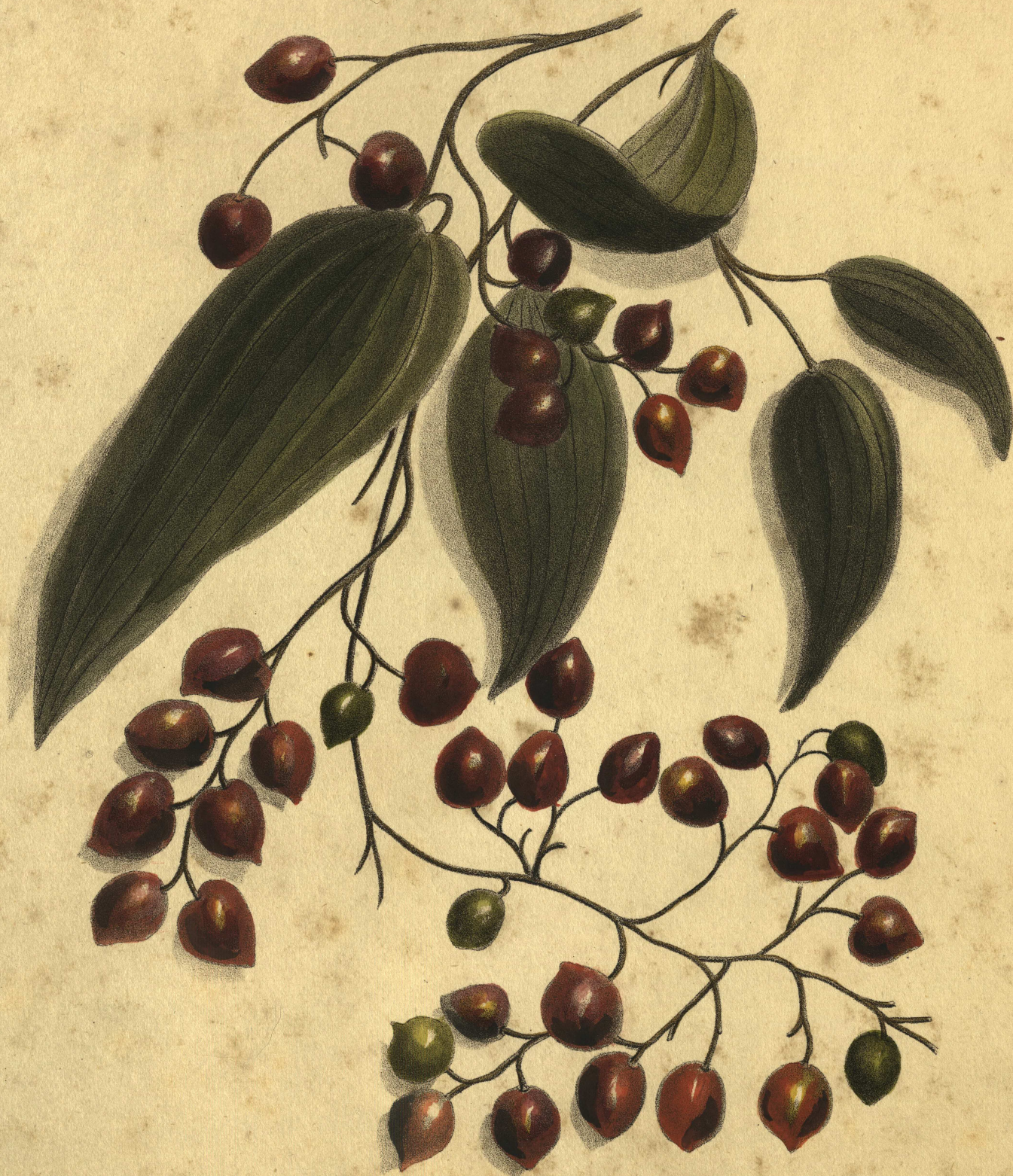
Rhipogonum scandens. (Supple-jack)

Fall climbing plant with long and slender stems, forming interwoven wry masses in the forest very difficult to penetrate. Flowers very small greenish-white, berries bright scarlet, variable in size. Abundant throughout New Zealand. The long underground root stocks have been used as Sarsaparilla, and the stems for basket work and hurdles.