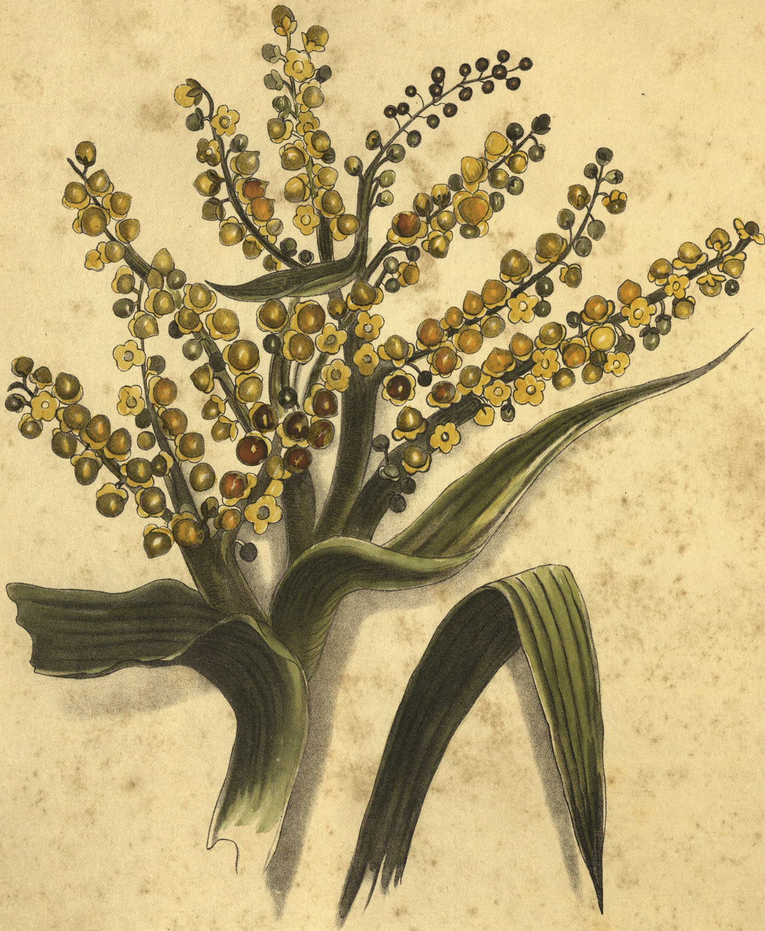
Astelia grandis. (Kowhara-whara)

A plant with long smooth grass-like leaves, and orange colour berries. Forest of the North Island.