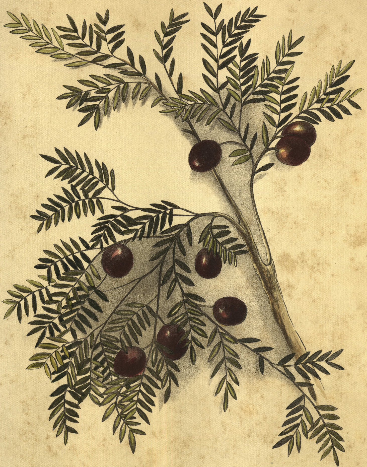
Podocarpus ferruginea. (Miro)

A lofty timber tree 50-80 feet high, common in the forest throughout New Zealand, one of the Black Pines of the Settlers. The red berries have a strong taste of turpentine, and are greedily eaten by birds, especially pigeons.