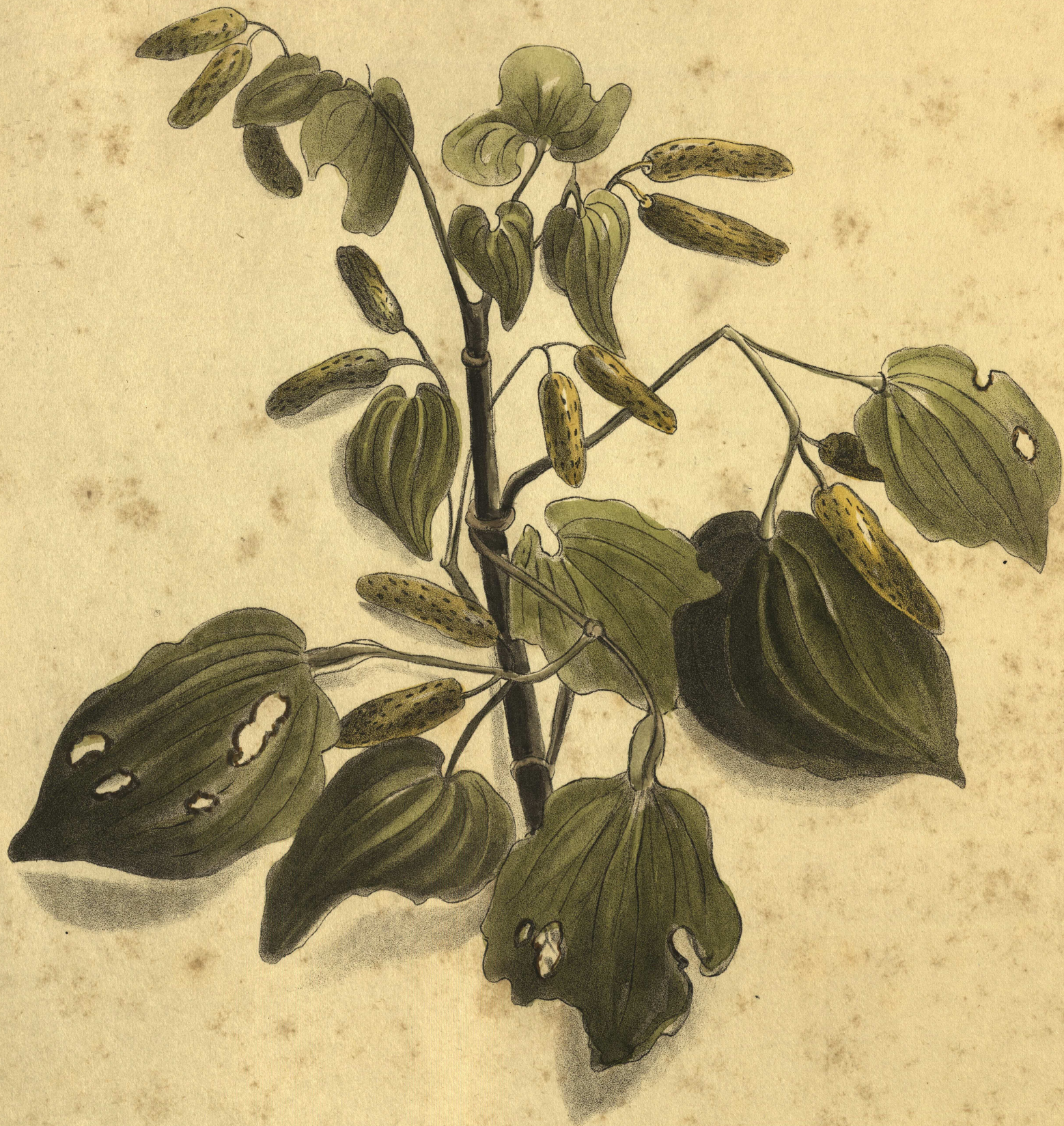
Piper excelsum. (Karakawa)

A large bush, often 20 feet high, leaves very aromatic berries yellow with black spots. North Island, and as far south as Canterbury.