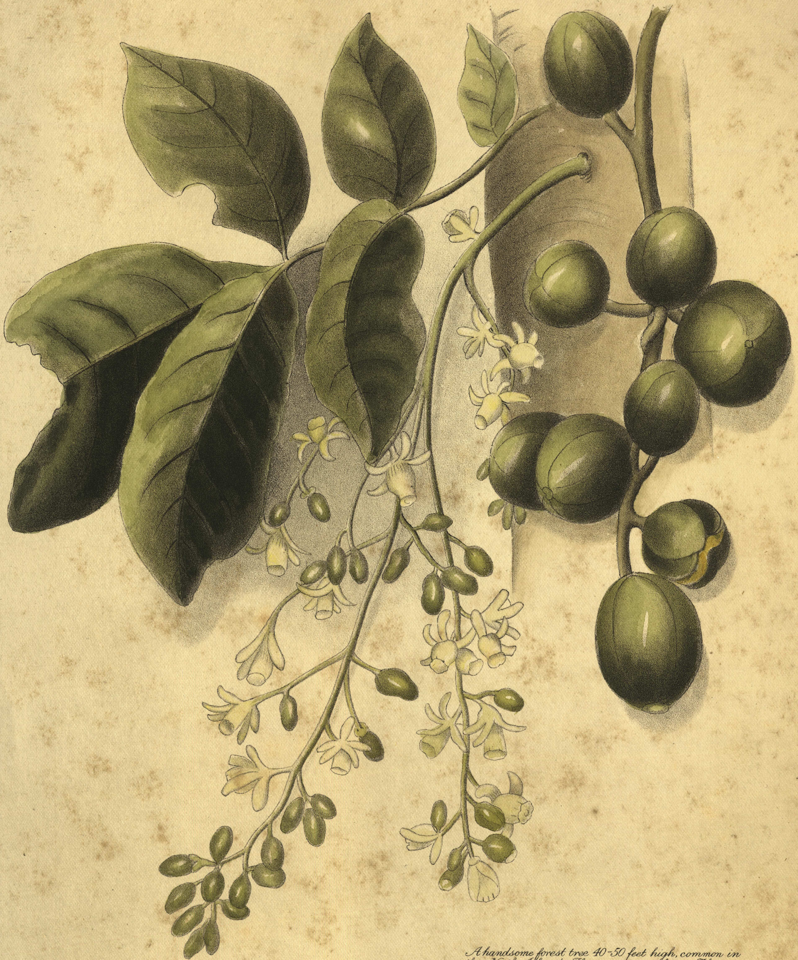
Dysoxylum spectabile. (Kohe - kohe)

A handsome forest tree 40-50 feet high, common in the North Island. Flowers waxy-white. Flowers and ripe berries on the tree at the same time. Berries green, with orange colour seeds.