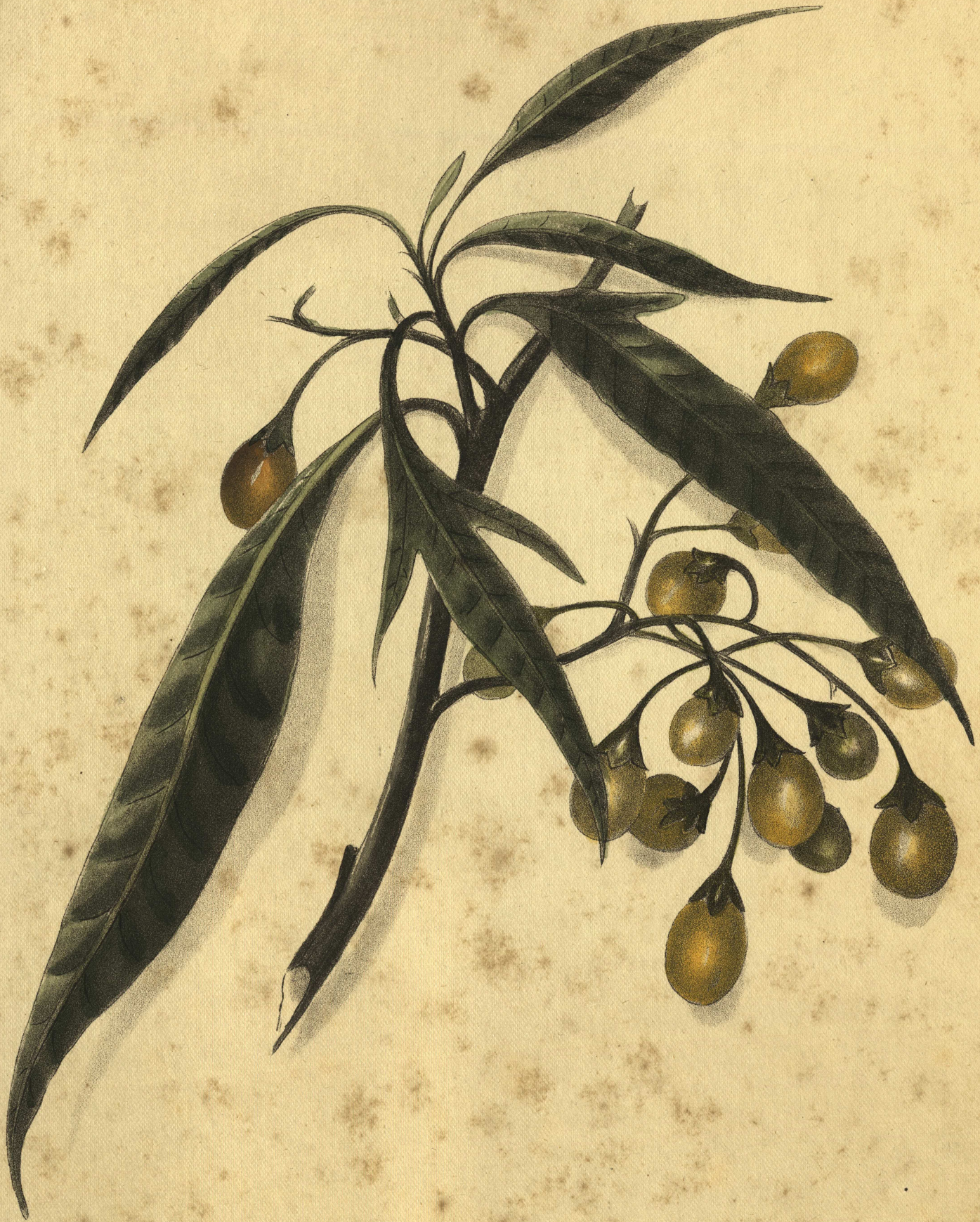
Solanum aviculare. (Poropora)

A shrub very common in the North Island, quickly springing up wherever the forest has been cleared. Leaves vary from 4-10 inches long. Berry yellow, edible.