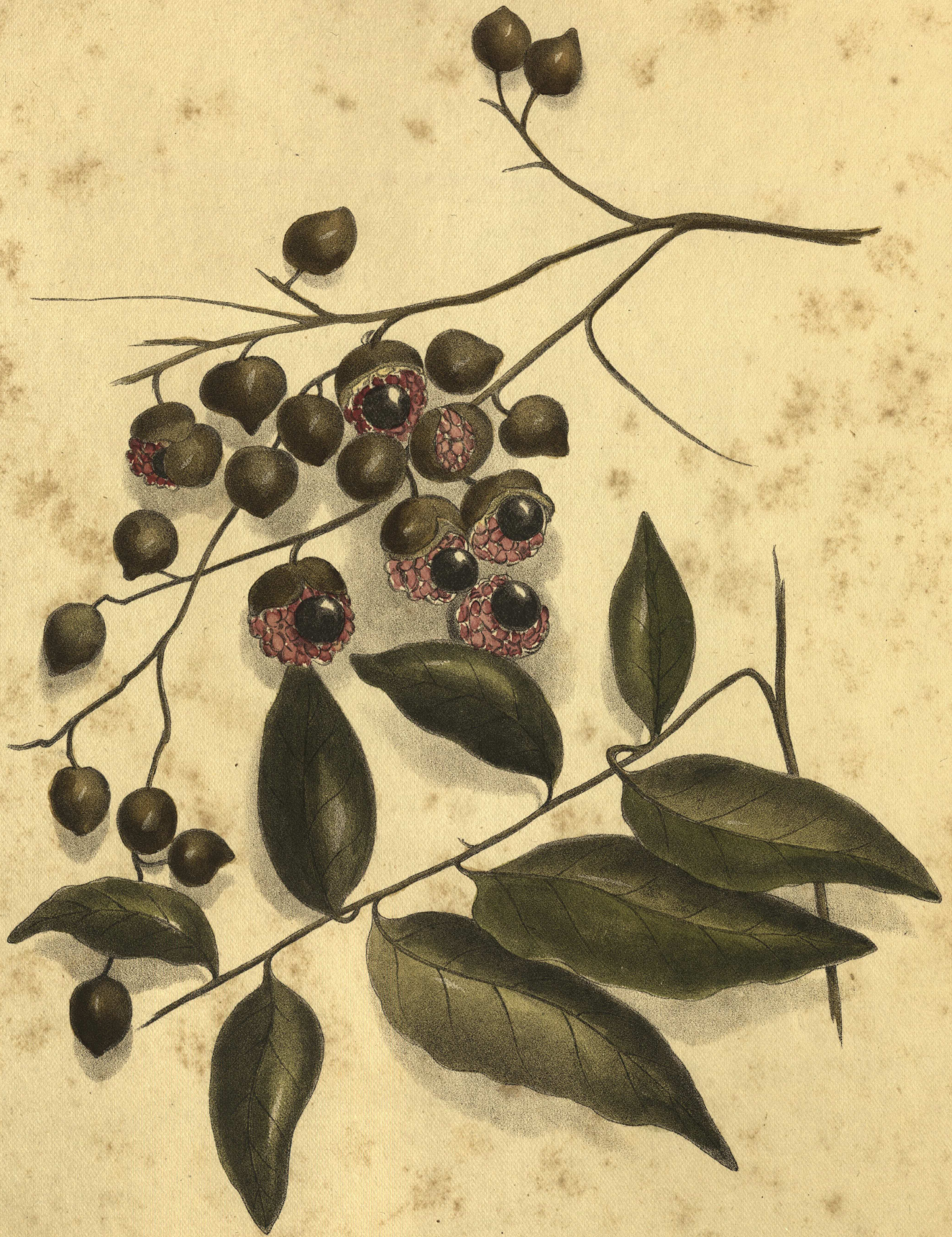
Electryon excelsum. ( Titoki )

A lofty tree common in the forest of North and South Islands. The only species of the genus and confined to New Zealand. Berries bright scarlet with one black shining seed.