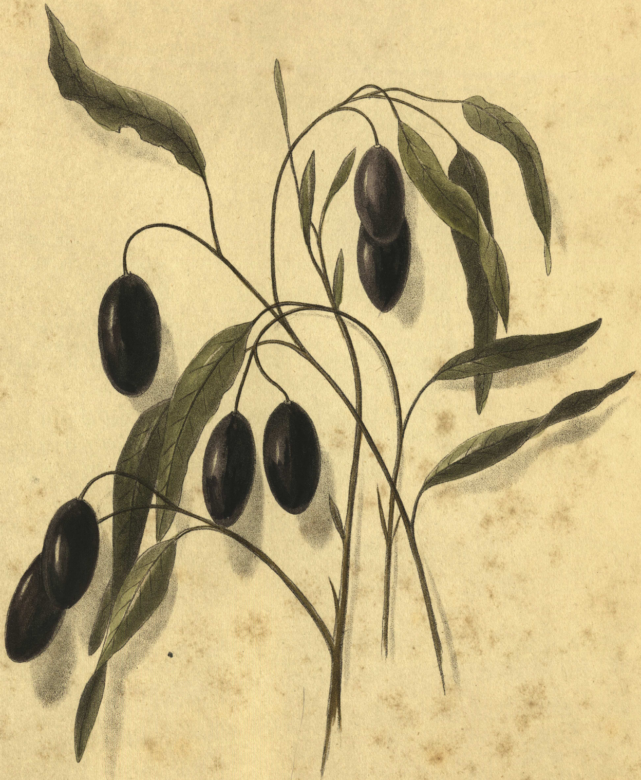
Nesodaphne Tawa (Tawa)

A lofty forest tree, 60-70 feet high. Leaves 3-4 inches long, very aromatic. Berries purple with a strong taste of turpentine, pigeons are very fond of them. The genus has one other species both confined to New Zealand.