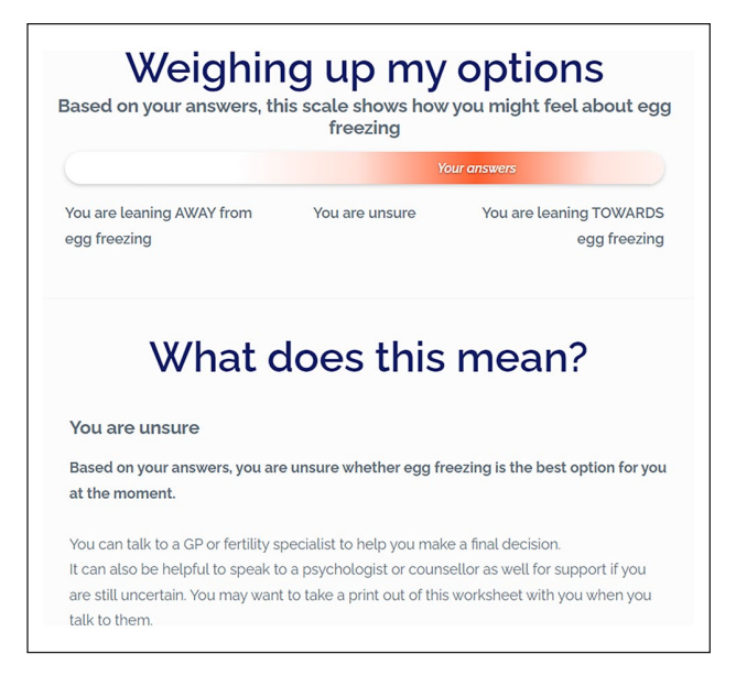
Figure 1. Results image from the values clarification exercise.

Intervention group. Participants allocated to the intervention arm will receive access to the DA and a link to the VARTA website. The development and content of the DA will be reported in detail elsewhere (Sandhu, 2022, unpublished). In brief, it includes information about: common causes of female infertility (including age); the pros and cons of EEF; the EEF process; success rates; patient experience narratives; options for using frozen eggs; health, social, and psychological implications; and a values clarification exercise to help guide decisions. The values clarification exercise will ask participants to allocate a level of importance (not, somewhat, or very) to four benefits (e.g. 'Doing something about your fertility now rather later') and level of worry (not, somewhat, or very) to four egg freezing drawbacks (e.g. 'Egg freezing does not guarantee a baby when I am ready to have one'). Participants will have the option to add additional benefits and drawbacks specific to their experience. Each rating will be allocated a score (from 0 to \pm 2 ). Total scores will be averaged, and a standard deviation (SD) is calculated. These will be on a scale showing if they are leaning towards or against egg freezing (Figure 1). Participants will then be asked if they agree with their results (Figure 2).