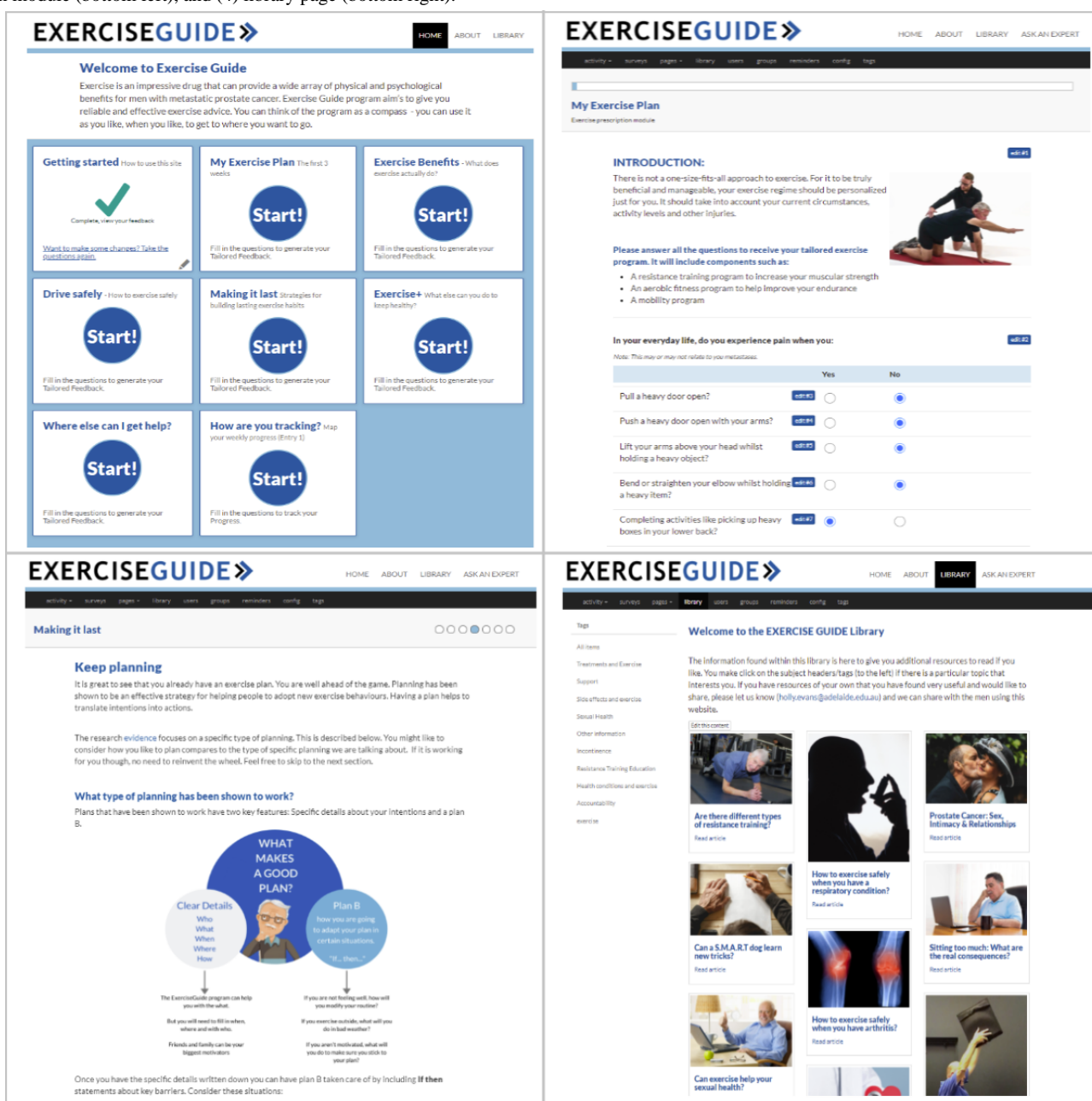
Figure 2. ExerciseGuide website screenshots of (1) the home page (top left), (2) Making It Last module tailoring questions (top right), (3) My Exercise Plan module (bottom left), and (4) library page (bottom right).

resource efficient [30]. The ExerciseGuide website was presented on either a Windows (Microsoft Corporation) or Apple (Apple Inc) laptop, as chosen by the participants. A researcher (HELE) asked the participants to verbally narrate their thought processes and feelings while completing the designated tasks on the ExerciseGuide website (Multimedia Appendix 1). The tasks included logging in, answering module questions (to read tailored content), generating their personalized exercise prescription, watching videos, and identifying key tools such as the library and frequently asked questions (Figure 2). When the participants fell silent for approximately 30 seconds or became stuck in a particular task, they were encouraged to express what they were thinking. The think-aloud sessions were audiotaped, and written notes were taken by the researcher.