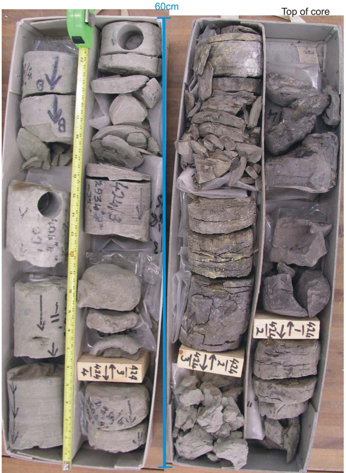
Bottom of core