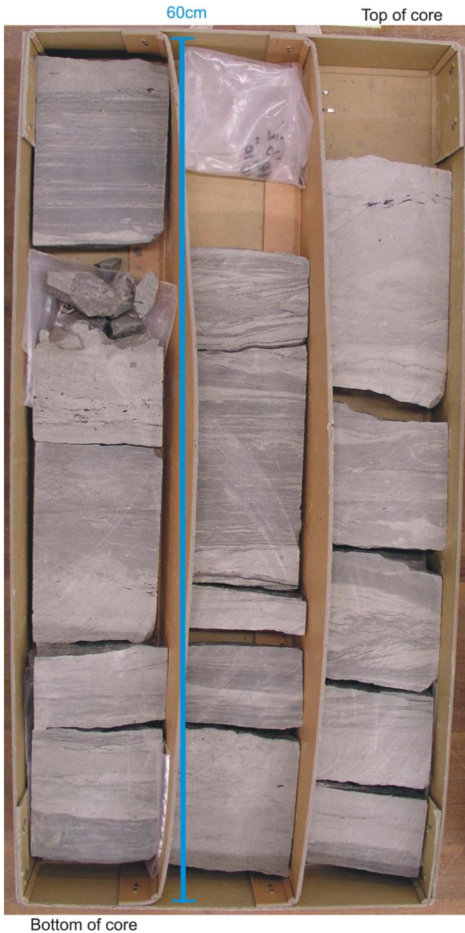
Bottom of core