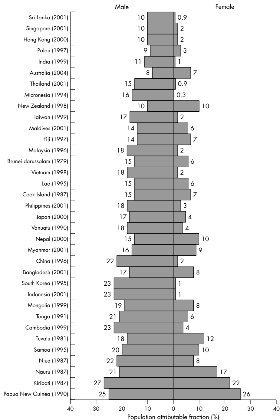
Figure 4 Population attributable fraction (%) of ischaemic stroke caused by smoking.

methods to verify CVD outcomes, and the lack of standardisation could have some effect on the estimation of the HR. Of particular importance for the current study is that only 57% of fatal strokes were classified by subtype and, while pathological diagnoses were verified by imaging or autopsy, limited information was available from many studies.