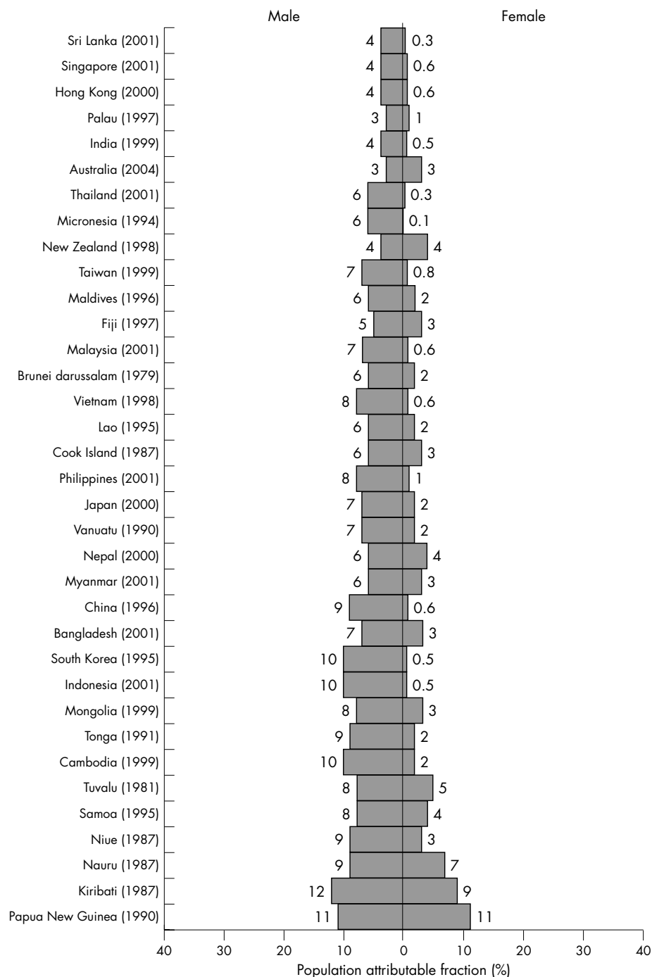
Figure 3 Population attributable fraction (%) of haemorrhagic stroke caused by smoking.

self-reported, dichotomous variable (yes/no) reflecting status at baseline, since few variables on smoking habits are included in the Collaboration. Thus PAFs could not be calculated using duration of smoking, although duration is recognised as more important than daily consumption of cigarettes in determining the effects of smoking on some health outcomes such as cancer. 16 However, the relative importance of duration versus daily consumption smoking measures is less clear for cardiovascular outcomes. 19 If the measurement of the duration of smoking is important for CVD, as it is for cancer, then the inclusion of ex-smokers in the reference group will have led to an underestimation of the RRs associated with current versus never smoking and a concomitant underestimation of PAFs.