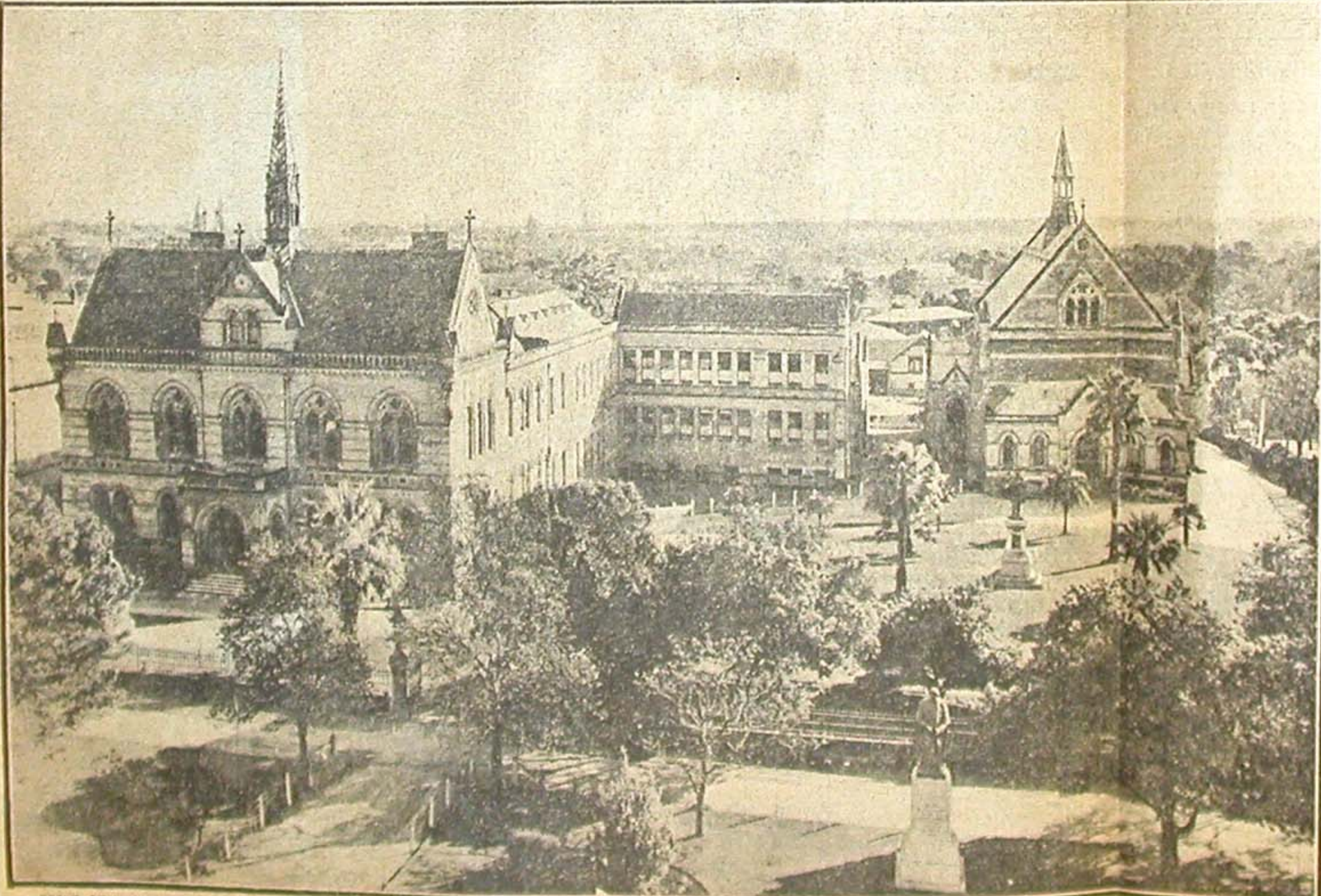
SOME OF THE UNIVERSITY BUILDINGS, SHOWING THE ORIGINAL BUILDING ON THE LEFT AND THE ELDER CONSERVATORIUM ON THE RIGHT.