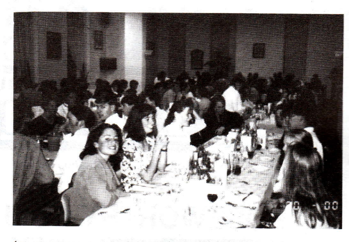
'Residential students enjoying their meal and company

The exciting new direction mapped out for the Association now identifies ROCA as being the official old students' body of the recently established "Roseworthy College", the organisation providing